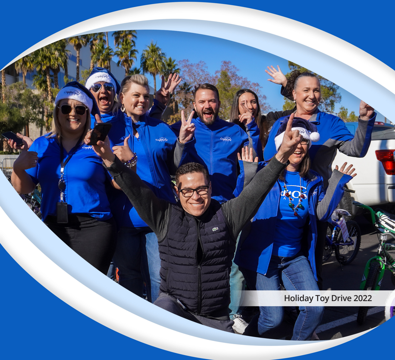
Holiday Toy Drive 2022