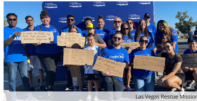
Las Vegas Rescue Mission