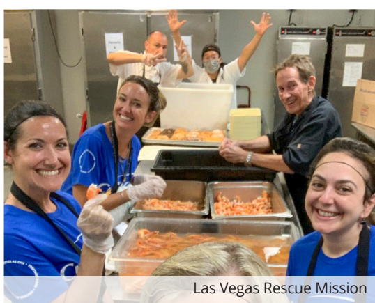
Las Vegas Rescue Mission