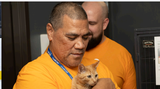
Best Friends Credit Card