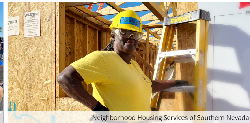
Neighborhood Housing Services of Southern Nevada