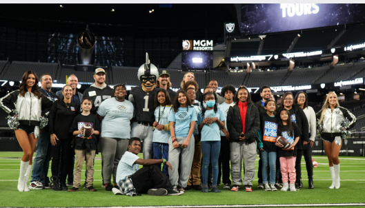
One for the Community