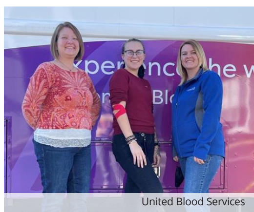
United Blood Services