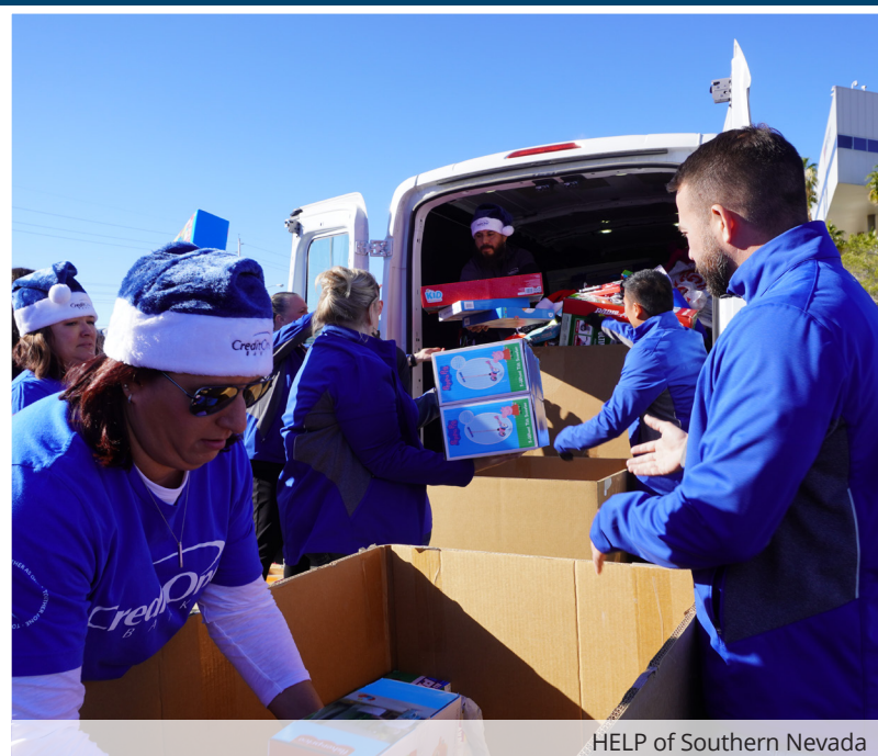
HELP of Southern Nevada