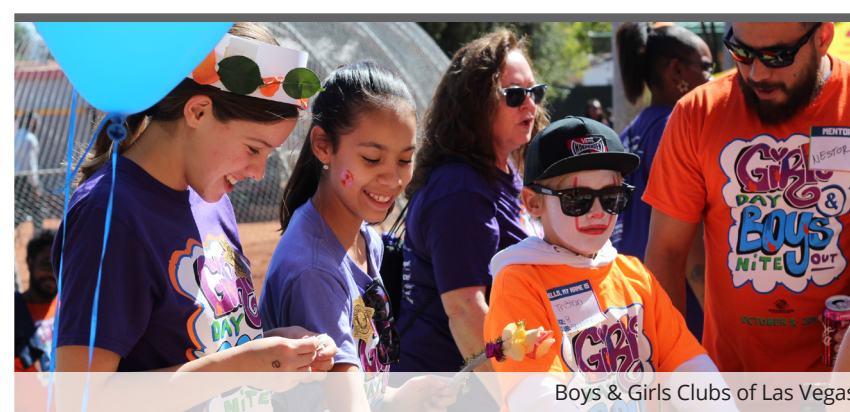
Boys & Girls Clubs of Las Vegas