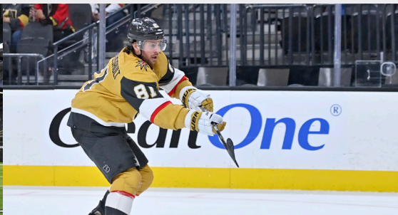
Vegas Golden Knights Foundation