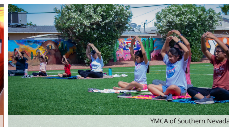
YMCA of Southern Nevada