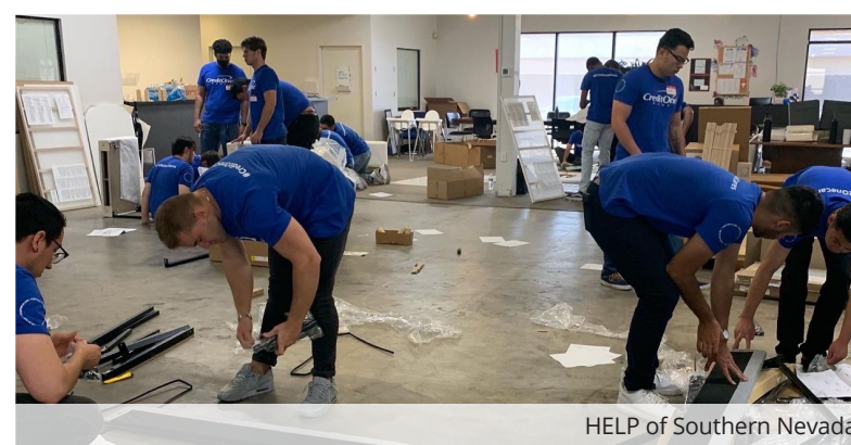
HELP of Southern Nevada