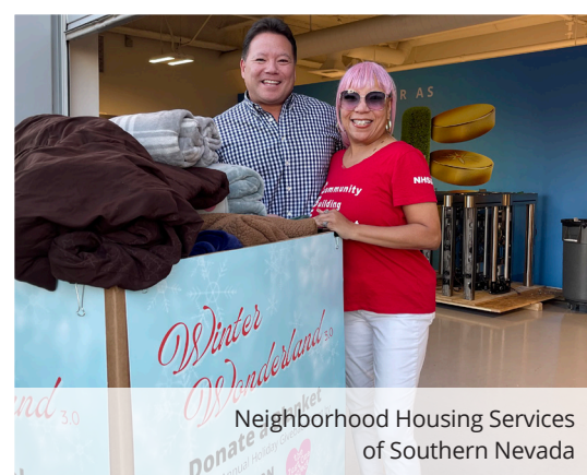
Neighborhood Housing Services of Southern Nevada